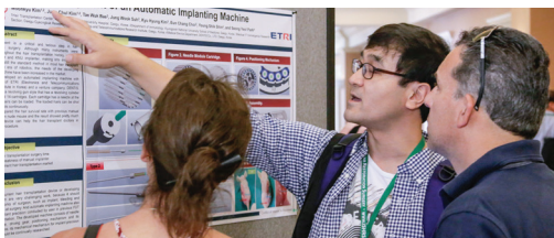
EXHIBIT HALL, SCIENTIFIC POSTERS AND NETWORKING EVENTS

EXHIBITS Companies of interest to hair restoration surgeons will be showcasing their products and services. Representatives will be available to answer questions.